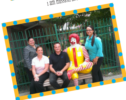
Marriott @ The Rim