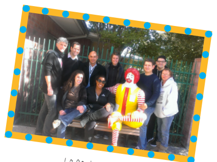
La Cantera Resort