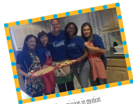
i am mission in motion