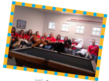
Wells Fargo Bank