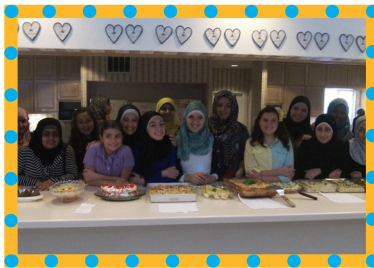
Muslim Youth Group