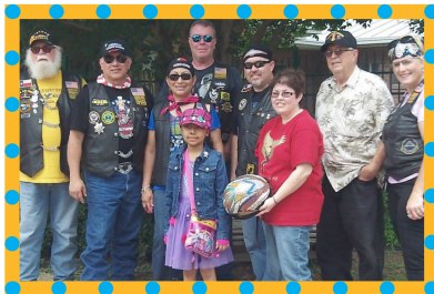
American League Riders